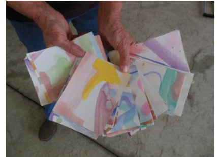
Completed Spirit Cards