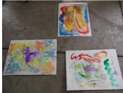
Works in progress