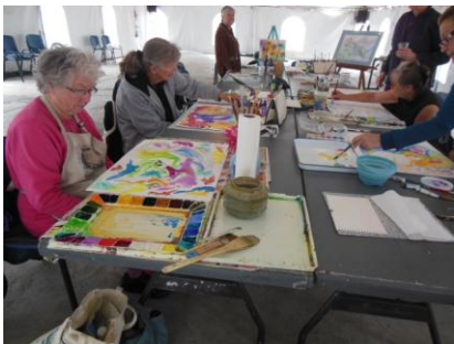
Artists at Work